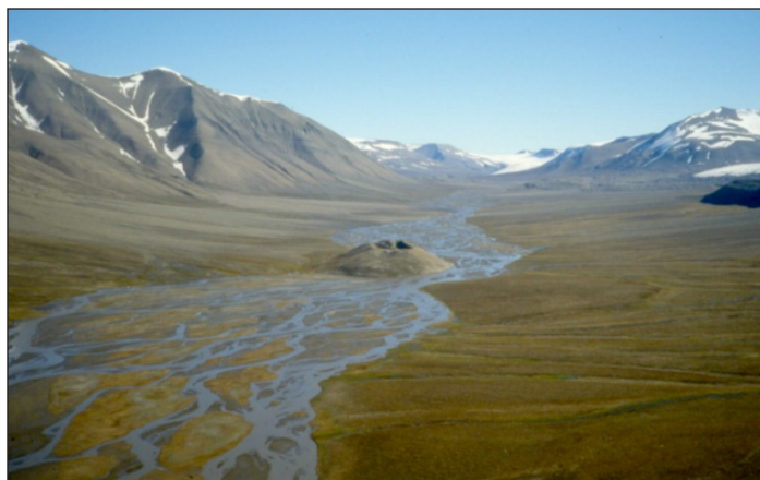
NGEE–Arctic. Permafrost stores massive quantities of carbon in frozen soil. Release of this carbon as permafrost thaws in a warming Arctic represents a potential tipping point for climate change. [University of Alaska, Fairbanks]

TES research focuses on understanding both the ecological effects of climate change and ecosystem feedbacks between the biosphere