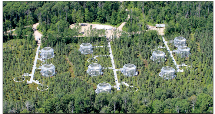
Aerial View of SPRUCE Project Site. SPRUCE research is being conducted on an 8.1 hectare peatland of the Marcell Experimental Forest in northern Minnesota. Ten open-topped aboveground enclosures are being used to simulate various levels of warming and CO 2 exposure. The remote landscape includes a mix of uplands, bogs, fens, lakes, and streams.

To identify and quantify these critical environmental response mechanisms, the Terrestrial Ecosystem Science (TES) program within the Department of Energy's (DOE) Office of Biological and Environmental Research (BER) is supporting a whole-ecosystem experiment in an ombrotrophic bog (i.e., a raised bog that receives all water and nutrients from direct precipitation) located in the Marcell Experimental Forest of northern Minnesota. The Spruce and Peatland Responses Under Changing Environments (SPRUCE) experiment project, led by Oak Ridge National Laboratory (ORNL), enables the assessment of ecological responses across multiple spatial scales—including microbial communities, moss populations, various higher plant types, and some insect groups. The project is evaluating a wide range of increased temperatures and levels of elevated atmospheric CO 2 concentrations. Direct and indirect effects of the experimental perturbations are being tracked and analyzed over a decade. This